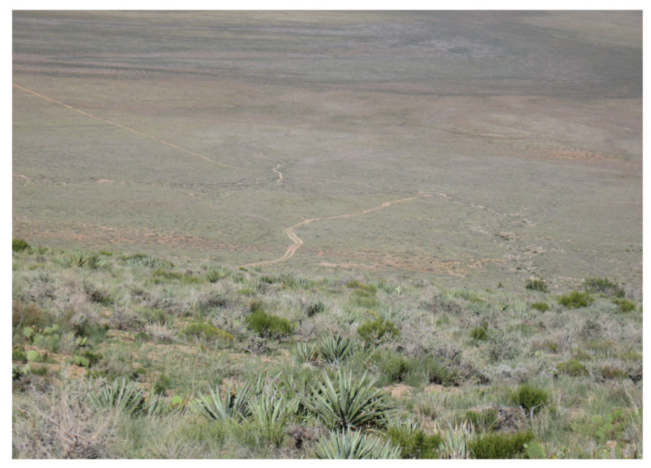
11-10 Long Descent to House Rock