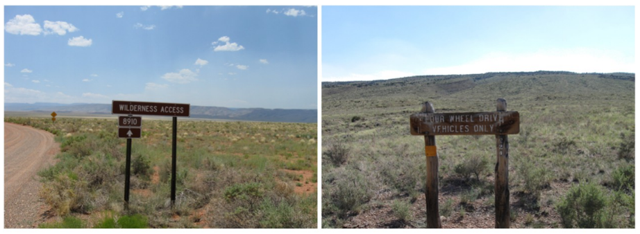
11-1 Entry to House Rock