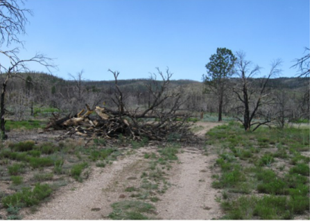
11-16 Fallen Tree Area